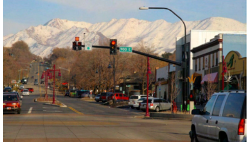
Local neighborhood including restaurants we will be recommending

registration in the afternoon and evening on Sunday and sessions throughout the day on Monday, Tuesday, Wednesday, and Thursday, leaving evenings free for additional scholarly exchange, socializing, and exploration. Friday is tentatively reserved for some excursions around the Salt Lake City area.