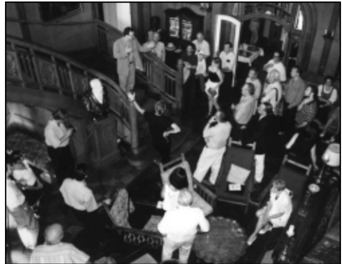
Workshops at the KLI often commence by filling the main hall.

Three new committees have been established and populated: the Membership Development Committee,