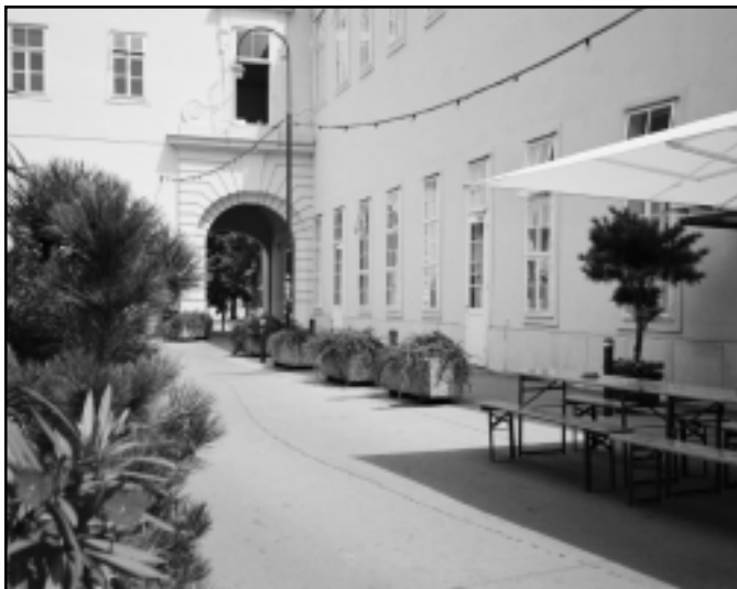
The courtyards between buildings at the University of Vienna include beer gardens and places for casual conversation.

This paragraph is addressed to members of the Society who have steady employment. Many presentations at the 2003 Vienna meeting will be made by students and independent scholars, people with limited