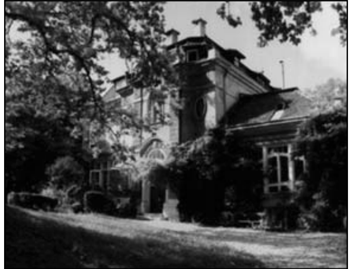
The Lorenz Mansion at the KLI viewed from the garden.

Reliance on biological science for the making of policy has never been greater, particularly as more emphasis is placed on the understanding of biological mechanisms for shaping policy. However, such use raises multiple issues, including 1) what role biologists should play in the policy-making context, 2) what the implications are for the use of biology in policy-making, 3) where and whether a science/policy