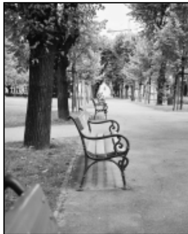
Benches line the walkways around the University of Vienna, where ISHPSSB members will meet in 2003.

Additionally, all graduate students will be expected to supplement the travel award at a comparable level regardless of funding provided by ISHPSSB. Thus, if travel costs and awards from Europe to the conference site are $750, while travel costs and awards from the US are $450, the students in both cases will be expected to bear an equivalent share of the additional expenses (for example, if additional expenses amount to $150, in both cases the students will be expected to assume those charges).