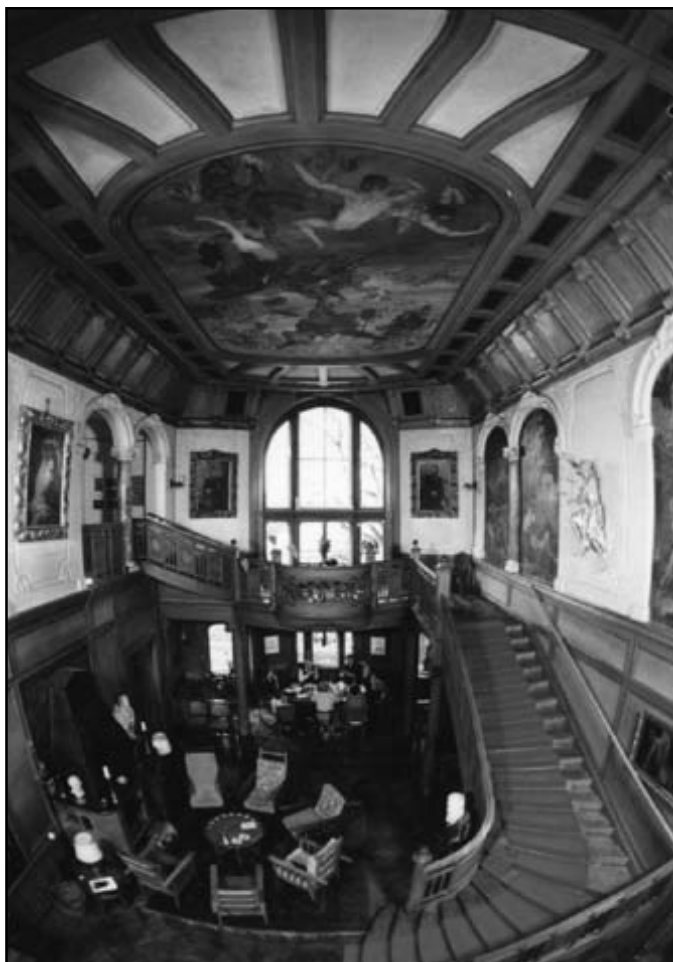
The main hall at KLI welcomes visitors.